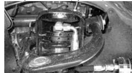
Fig. 2: Passenger side

the upper control arm and lower the suspension to allow the removal and installation of your shock assembly. Be careful not to damage any brake lines or electrical wires.