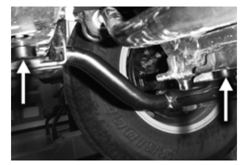
Fig. 6: Skid plate brace spacers

14. On external reservoir models, mount the reservoir onto the reservoir bracket with the supplied hose clamps. Utilize the slots in the bracket to locate the clamps. Do not feed the clamps