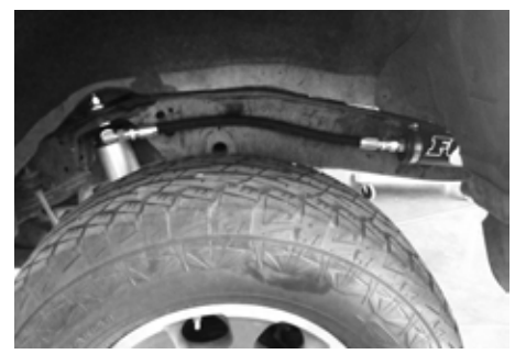
Fig. 8: Driver side

from factory bump stop brace with the top edge of the bracket being flush with the top of the vehicle frame. Mark the center hole and drill a 7/32" pilot hole then secure the reservoir bracket to the fame with one of the