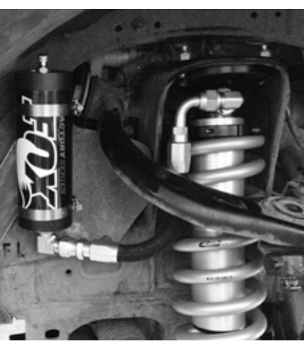
Fig. 2: Driver side hose orientation

sway bar to the vehicle frame. Move sway bar forward to allow clearance for shock removal/installation.