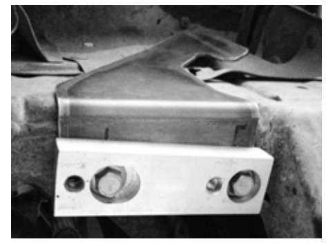
Fig. 3: Driver side sway bar relocation spacer