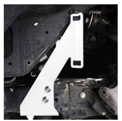
Fig. 4: Driver side reservoir bracket

careful to not to damage any brake lines or electrical wires.