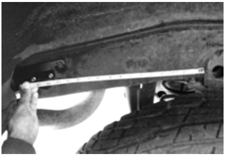
Fig. 7: Passenger side reservoir bracket mounting