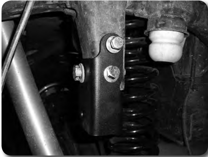
Figure 10 - LHD Shown