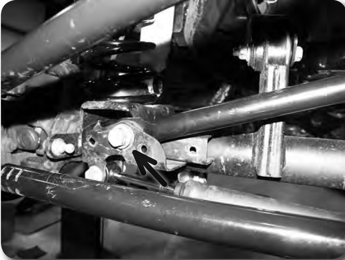
Figure 1 - Left Hand Drive Shown