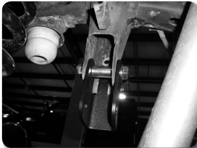
Figure 9 - LHD Shown